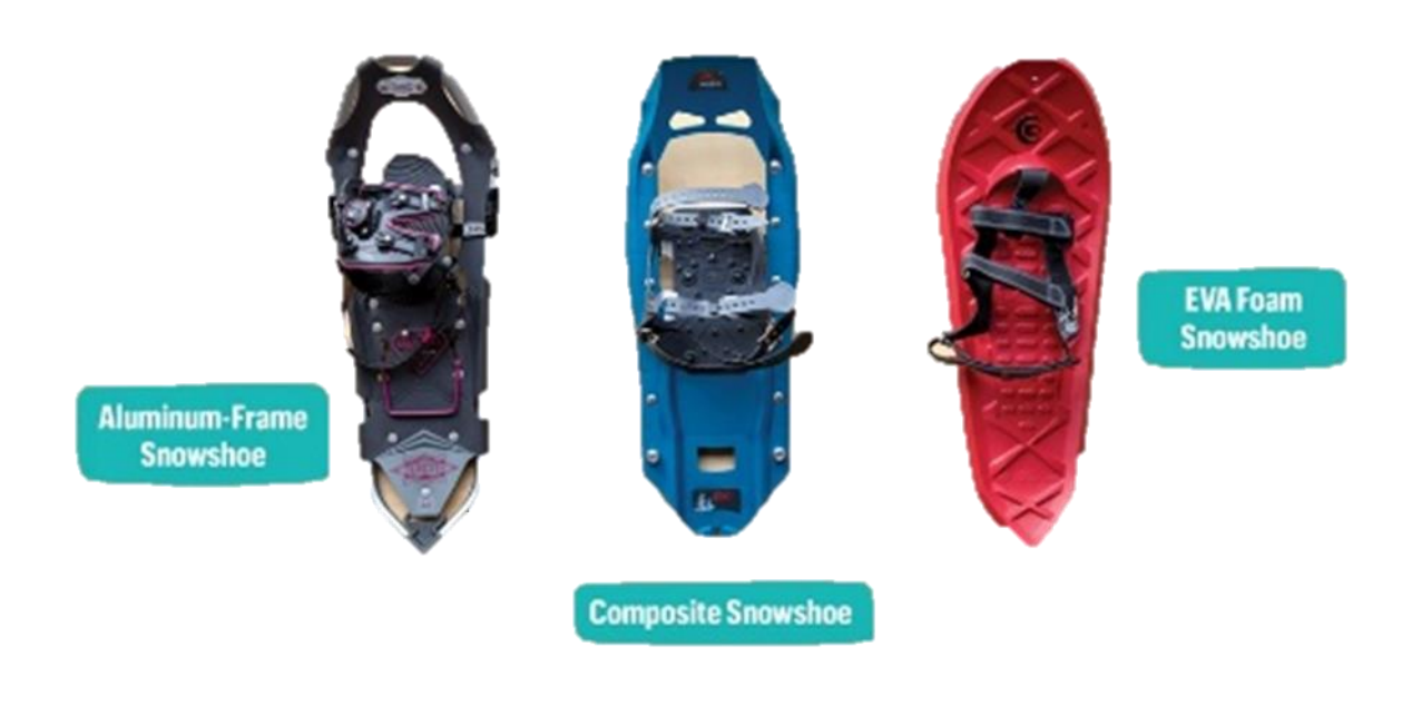
vi: Different material snowshoes

<u>The Official Special Olympics Rules for Snowshoeing</u> state that the snowshoe frame shall not be smaller than 17.78 cm x 50.8cm (7 inches x 20 inches). This size works best for most adults.