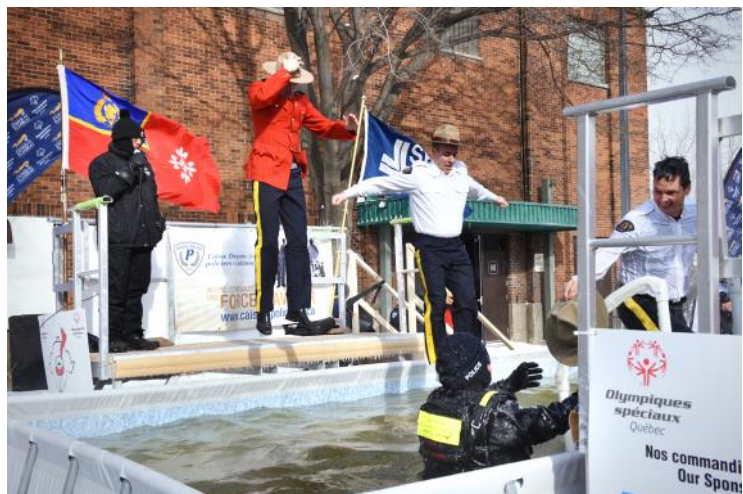
RCMP officers' take the plunge in uniform! 1, 2, 3 GO!