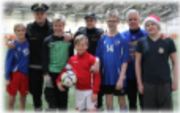
Soccer Game Between Police and Athletes