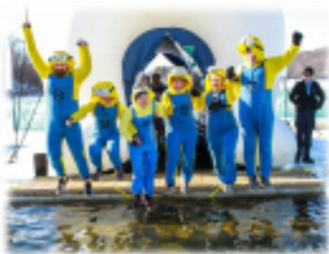
Minions was a super popular costume at Minnesota's Plunges this year. This group was taking the Plunge at Maple Grove, where they had 615 Plungers raise over $200,000.