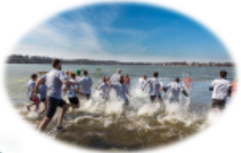
Minnesota's first ever Run In/Run Our style Polar Plunge took place this year at the Eden Prairie Polar Plunge on March 12 th . With temps in the 70s that day, and just inches of ice left, our normal Polar Plunge format needed to be adjusted!