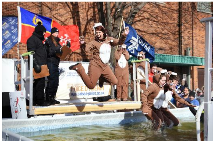
A very excited (or terrified) participant of this years' Montréal Polar Plunge anticipating the cold water ! It was -36°C that day!