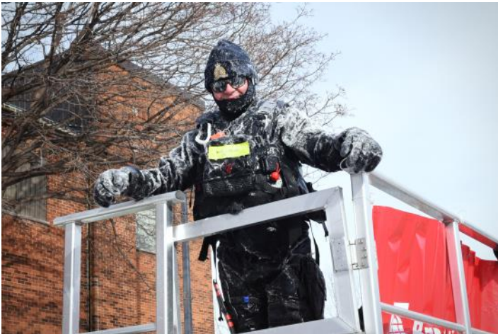
A brave soul, the RCMP diver spent all afternoon in the cold water, so much that icicles grew on his tuque. That's what a polar -36°C will do!