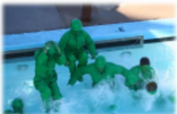
Oklahoma City Polar Plunge—Oklahoma Police Department—the Green Machine team!

What started with one plunge has now grown to 15 locations across the state. For those more sensitive to insanely cold temperatures, there is also the Too Chicken to Plunge option, where people can raise the $75 minimum and take advantage of everything the event offers without having to brave the freezing water. The polar plunges in Oklahoma had over 1,045 plungers fling themselves into freezing water to raise a cool $240,000 in 2016.