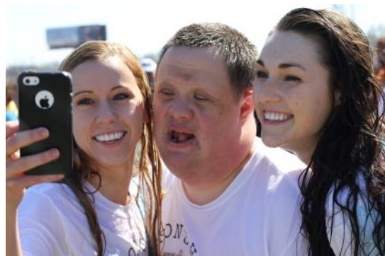
Athlete after plunge!