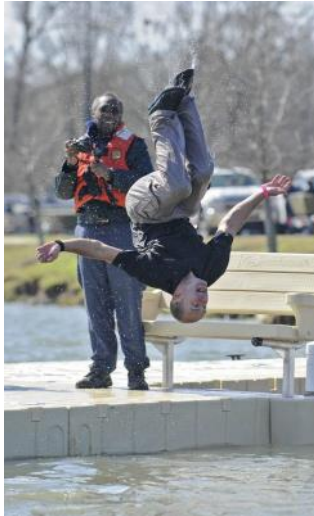
Polar Plunge Flip!

This year's Polar Plunge, benefitting Special Olympics Louisiana, has proved to be yet another successful event, with over 30 registered teams. Community members, Special Olympics athletes and law enforcement officials from around the state came out to Cabela's this past weekend to participate in the fundraising event.