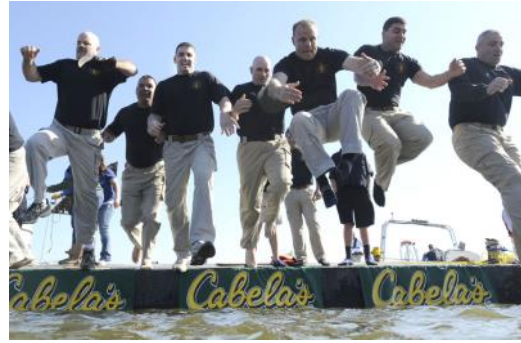
Polar Plunge Officers take the Plunge!

"He does his role as a law enforcement torch run officer, but he takes it to the next level, and he is always willing to go above and beyond for the Special Olympics," said Special Olympics