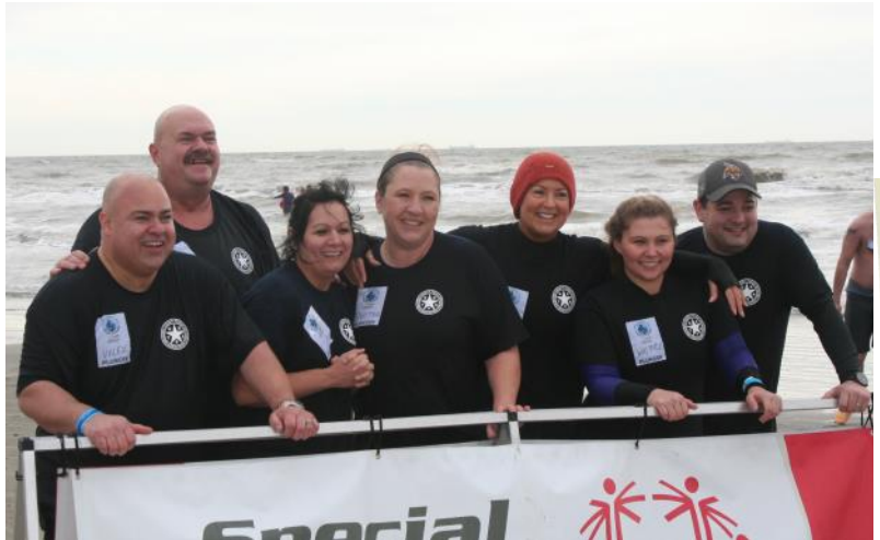
Members of the Brazoria County Peace Officers Association had a blast at the Polar Plunge. (This is a "before" photo.)

Special Olympics Texas supporters across the Houston metropolitan area traveled to Galveston in January 2016 to brave the chilly waters of the Gulf of Mexico. More than 300 intrepid plungers raised more than $47,170 in the event's sixth year. The Galveston event is the largest one in Texas.