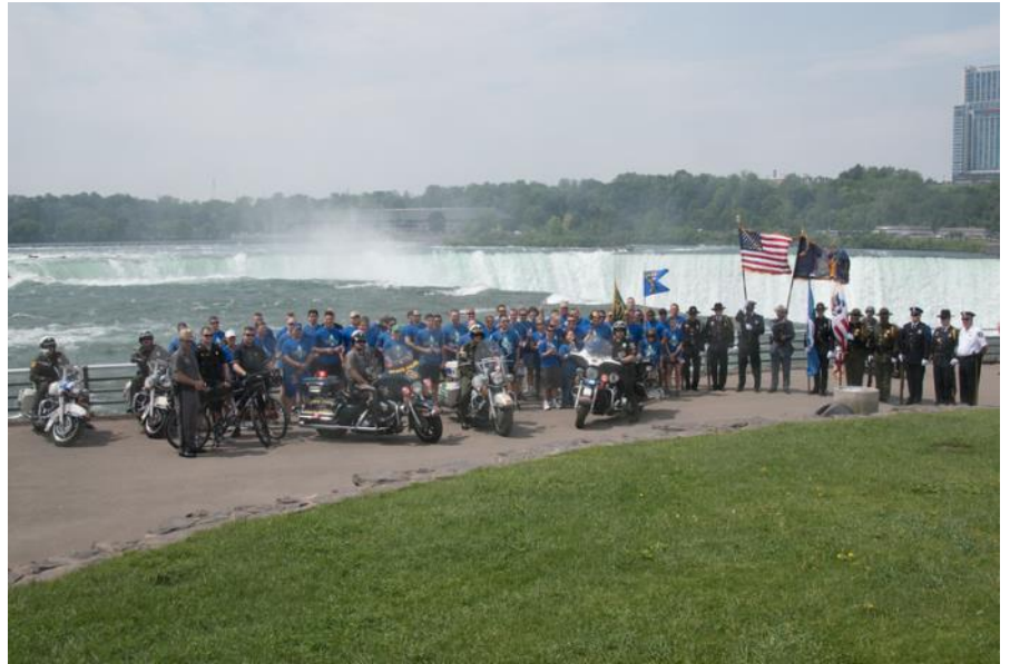
New York State Law Enforcement and NY Special Olympic athletes at Niagara Falls, USA