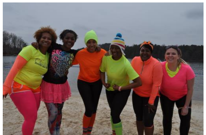
DJJ Team- "The Department of Juvenile Justice team stood out when they took the Plunge for Special Olympics Georgia Athletes!"