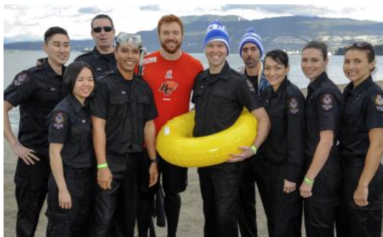
BC Lions quarterback Travis Lulay and Vancouver Police Department members get bold and cold at Vancouver’s first Polar Plunge.

Guests of all ages had fun checking out police department operations vehicles, along with the VPD mounted, marine, and canine units on display. Teams of VPD cadets and SOBC athletes roved the beach raising awareness and accepting donations.