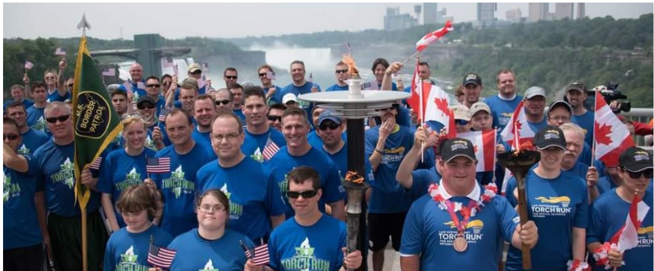
Law Enforcement and athletes come together to light the cauldron in the middle of the Rainbow International Bridge.

What started as a small, ceremonial Torch Run between New York State and Canada, has quickly spread across the world. An officer from the 914 th SFS, originally from Niagara Falls, is currently stationed in Kuwait and after participating in previous Torch Runs, he is currently hoping to model a similar Torch Run while overseas during his deployment.