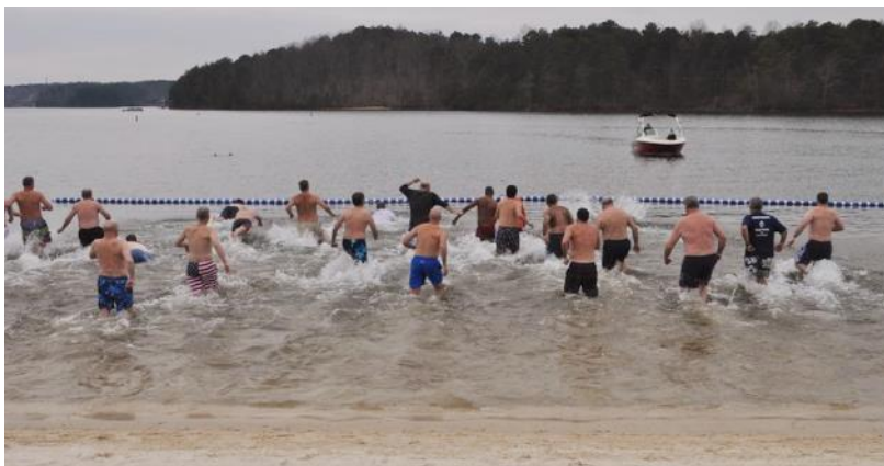
Knumb Knights Take the Plunge- "The Knumb Knights from St. Benedict Catholic Church in Johns Creek, Georgia take the Plunge at Lake Lanier. They have taken the Plunge the last 6 years for Special Olympics Georgia Athletes!"

The motto of Special Olympics best describes why I have made this commitment to serve: "Let me win, but if I cannot win, let me be brave in the attempt." Bravery, courage, and perseverance: these are only a few words that describe the outstanding athletes who compete with Special Olympics Georgia. And when I realize that I can do my part to enable these winners, I, myself, win. Because they are brave enough to attempt to win, I am encouraged to be cuffed for a cause, and I win. I am motivated to be freezing for a reason at the Polar Plunge, and I win. And when I see the athletes cross the finish line, in spite of every obstacle with the bravery to attempt, I win.