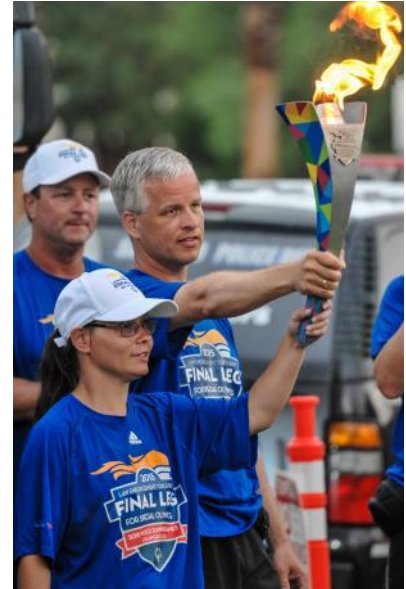
World Summer Games 2015