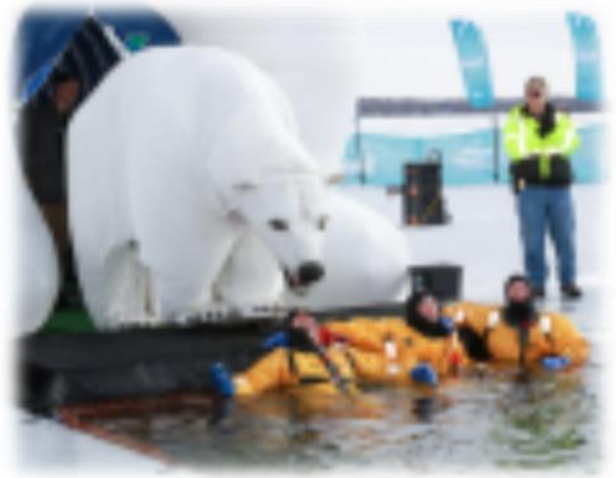
A Polar Bear Puppet (run by two puppeteers) sneaks up on the Ramsey County Sheriff's Office and Dive team as they wait for the White Bear Lake Polar Plunge to begin.