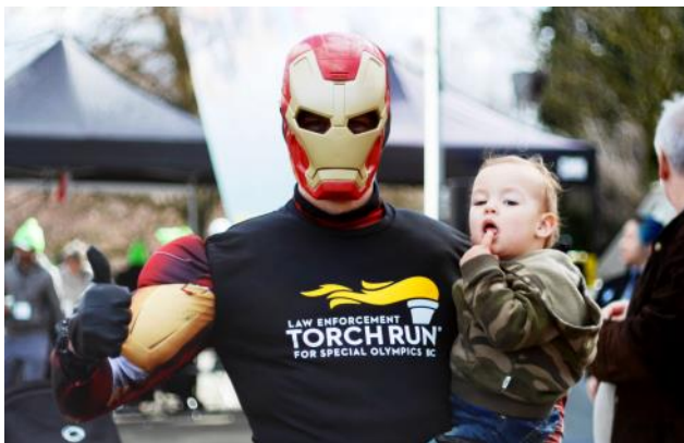
A Canada Border Services Agency member steels himself for the first-ever Vancouver Polar Plunge.

Visit us at www.specialolympics.bc.ca/letr and on Twitter at @BCLETR.