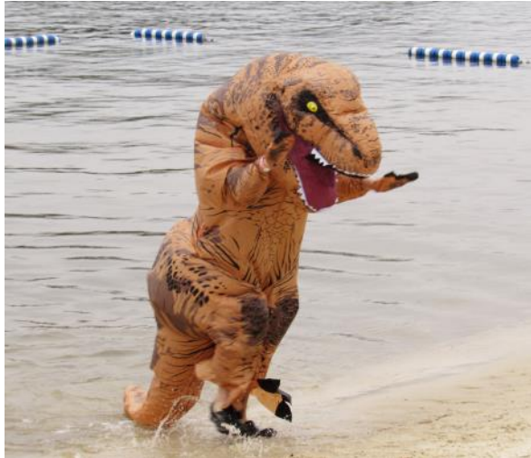
T Rex only gets a toe in- "Our T-Rex could only get her toes wet, but she still took the Plunge for Special Olympics Georgia Athletes!"

The motto of Special Olympics best describes why I have made this commitment to serve: "Let me win, but if I cannot win, let me be brave in the attempt." Bravery, courage, and perseverance: these are only a few words that describe the outstanding athletes who compete with Special Olympics Georgia. And when I realize that I can do my part to enable these winners, I, myself, win. Because they are brave enough to attempt to win, I am encouraged to be cuffed for a cause, and I win. I am motivated to be freezing for a reason at the Polar Plunge, and I win. And when I see the athletes cross the finish line, in spite of every obstacle with the bravery to attempt, I win.