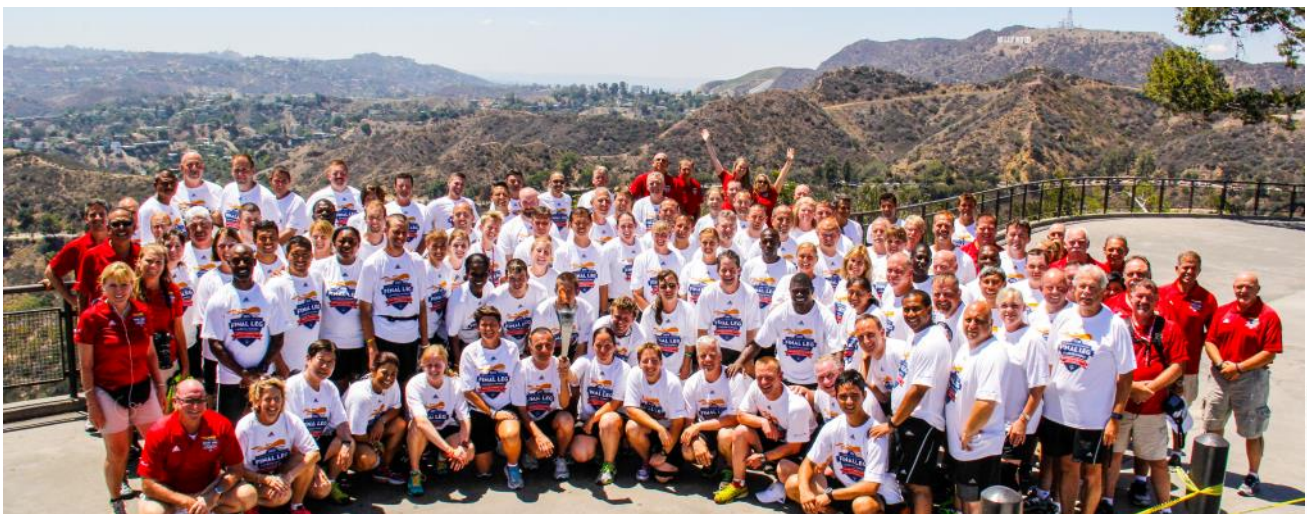
World Summer Games 2015

It was incredibly rewarding to participate in the 2015 World Summer Games in Los Angeles. Many Special Olympics athletes attended the events (which were five to six each day) and spent time with their families, many of them with their prizes to show. They were so grateful that we were drawing attention to them. There are no contestants as loving, sincere, or honest as those in the Special Olympics. We were treated so well everywhere, and at every event, there were police officers, firefighters, musicians, singers, dancers, entertainers, gymnastics, bands, cheerleaders and athletes. It was very memorable when all parties ran together across the Golden Gate Bridge. It will not be repeated. We went to Disneyland, and I brought a little rain with me from Iceland, but we all had a good time. In Westminster, I was honored when I was handed