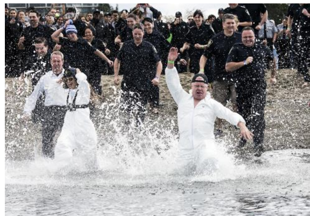
Law enforcement agencies including the Vancouver, West Vancouver, and Abbotsford police departments and Metro Vancouver Transit Police lead the inaugural Polar Plunge.