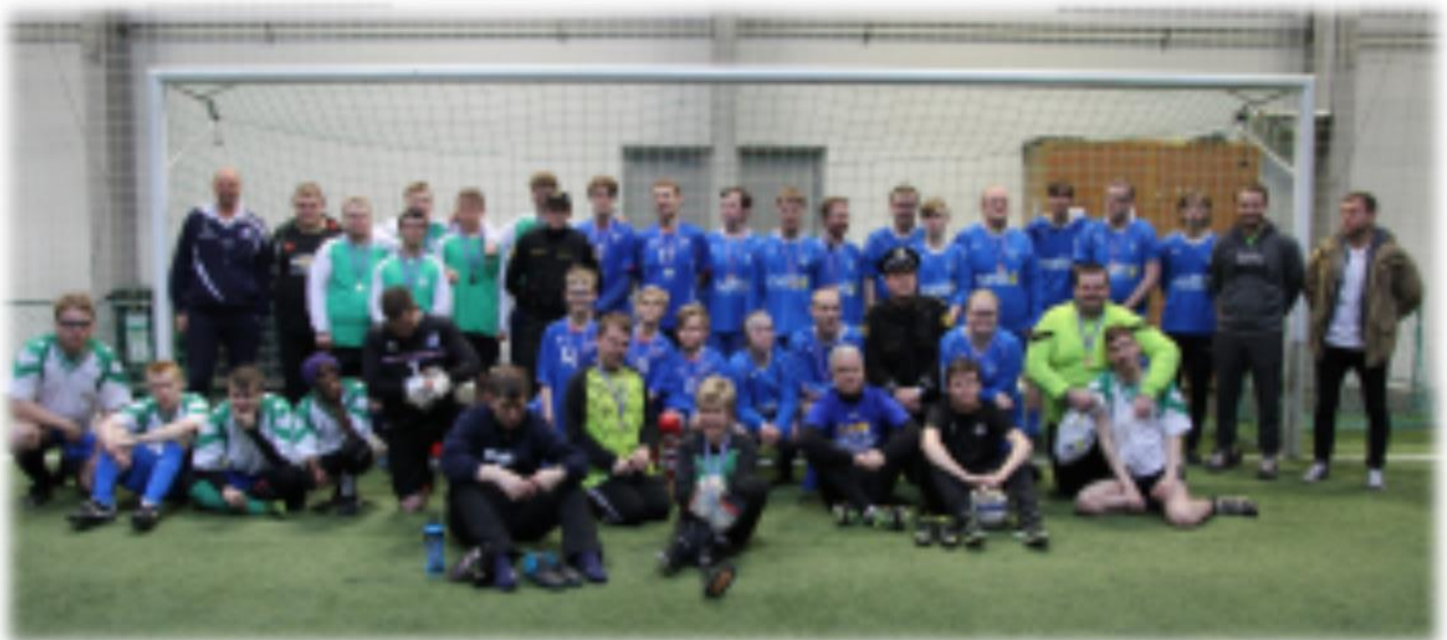
Soccer Game Between Police and Athletes