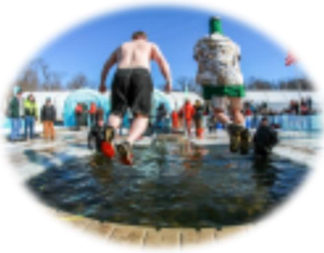
Plungers jump in at the Woodbury Polar Plunge. This second year event had 580 Plungers and raised over $107,000!