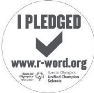
I Pledged Sticker - $0.07