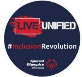
Live Unified Sticker - $0.15