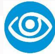
Opening Eyes (Vision)