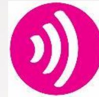
Healthy Hearing (Audiology)